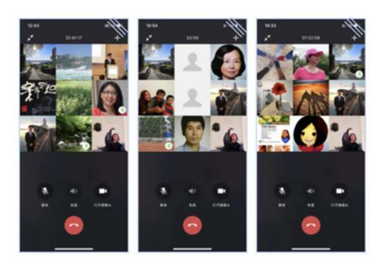
Figure 6: Screenshot of the report on the Zurich consulate general online meeting with various associations in Switzerland, including the Schaffhausen Chinese Association, in March 2020.