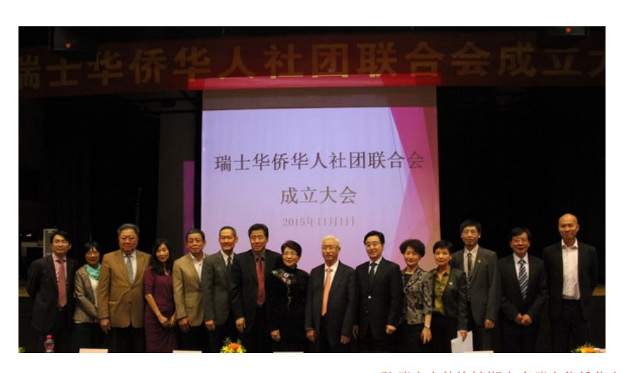
Figure 2: Group picture at the inauguration of FOCAS.