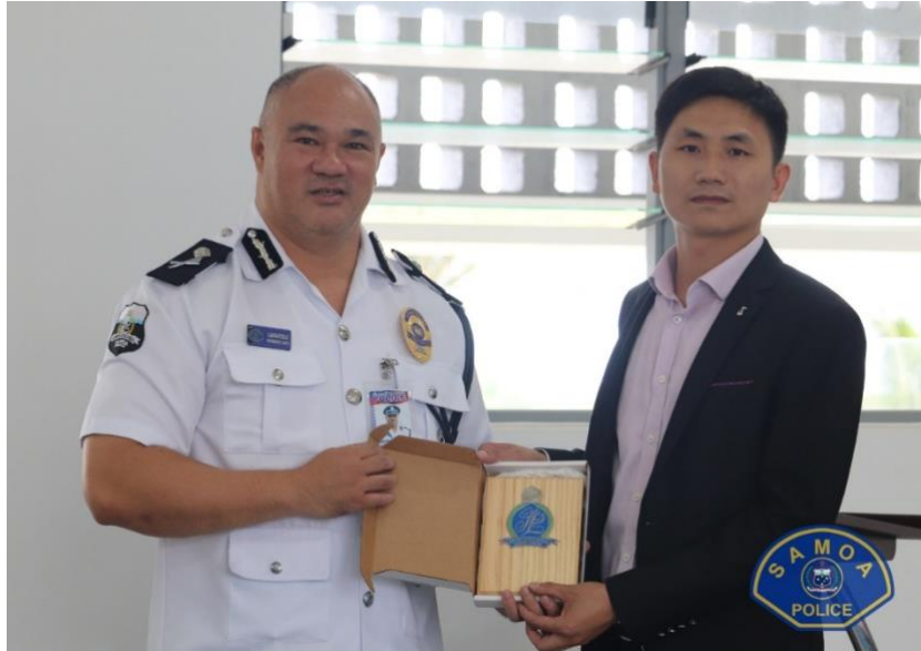
'Completion of Forensic Training and Handover of Equipment by Chinese Embassy', Apia, Sāmoa, Sāmoa Police, Prisons, and Corrections Service Facebook page, 5 December 2024, online .

On January 11, 2025, the PRC Embassy in Sāmoa held a 'Sāmoan Security Situation and Legal Lecture' for about 100 representatives of Chinese-funded institutions and overseas Chinese, 268 where Sāmoan police briefed attendees on local law and safety, so that they could “establish a good image for Chinese citizens”. 269