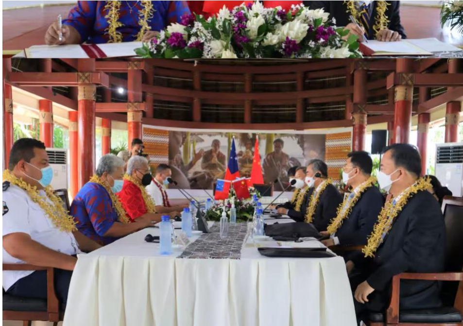
Prime Minister Fiamē, her chief of police, secretary for Foreign Affairs, and other staff meet with PRC Foreign Minister Wang Yi and his team to discuss strengthening security cooperation in 2022, online .

agreement saying that the Pacific can manage its own security. 247 Wang Yi was forced to leave Apia empty-handed, but he signed an Exchange of Letters for the Fingerprint Laboratory for Police, a “gift” complementary to the Police Academy. 248 The laboratory’s cost was never disclosed.