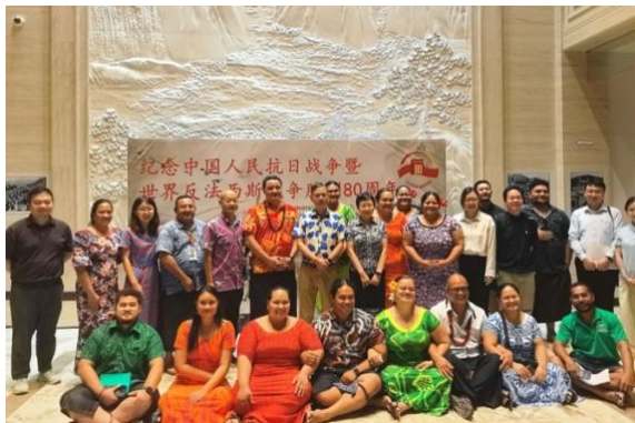
'Chinese Embassy in Samoa and Samoa Public Service Commission Co-host Exchange Meeting for Participants of Training Programs in China', PRC Embassy Sāmoa, 28 October 2025, online .

Since launching the Belt and Road Initiative in 2013, Beijing has dramatically expanded in-country training programmes across the Pacific. Between October 2013 and December 2017, China hosted Sāmoan officials in six senior civil-service research courses, eight tropical aquaculture training courses, and six tropical crop sessions. During that period, 102 Sāmoan students received full PRC government scholarships. 231 These exchanges have since become a pillar of bilateral cooperation. Since 2018, numbers of between 300 and 350 Sāmoan trainees go to China each year, in fields ranging from civil servants, teachers, chefs, farmers, medical personnel, journalists, scientists, artists, entrepreneurs, and NGO workers. 232 In such a small population that is a phenomenal number of people coming to study the China Model.