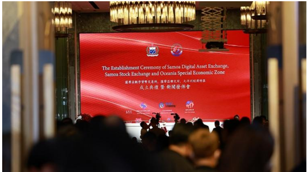
Sāmoa Digital Currency Exchange, Sāmoa Stock Exchange, and Oceania Blockchain Special Economic Zone Establishment Ceremony and Press Conference in Hong Kong, online .

During the event, Yao Zhisheng, a Standing Committee member of the Chinese People's Political Consultative Conference Standing Committee, outlined a vision to transform 50,000 acres in Sāmoa into 3,000 villas, 54 (sic) golf courses, a China-Sāmoa international university, hospitals, hotels, wellness centres, nursing homes, and more. Sāmoa would become a new financial hub for the Pacific. 109