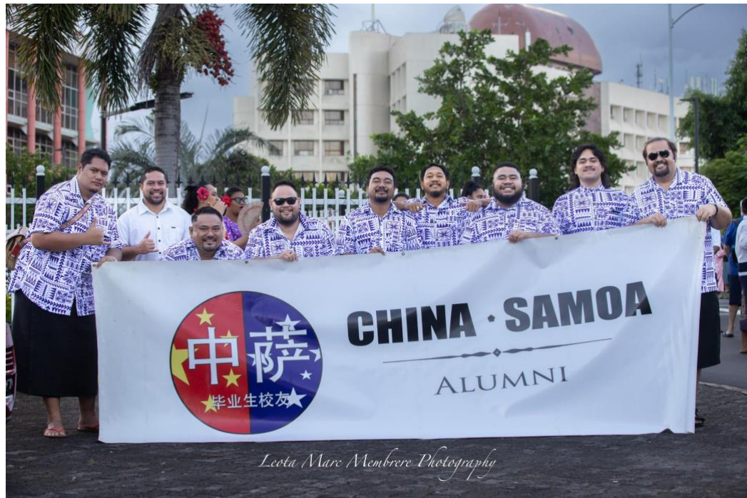
China-Sāmoa alumni march at Sāmoa's 2025 Independence Day Parade.

20, and now up to 30 annually. 366 In 2023 there were 88 Sāmoan students doing degree courses in China. 367