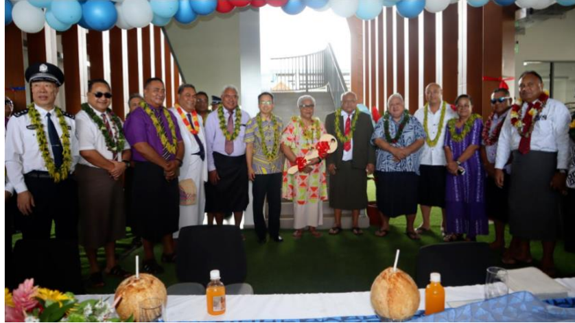
‘援萨摩亚警察学院项目举行移交仪式’ [Handover Ceremony Held for Samoa Police Academy Project], 商务部经济合作局 [Ministry of Commerce, Bureau of Economic Cooperation], 24 August 2024, online .

The academy took nine years to build, and in the process, China steadily strengthened its police cooperation with Sāmoa. In 2019, the PRC Embassy donated a set of brass instruments to the Sāmoa Police Band. 243 In 2021, eight officers from the Criminal Investigation Bureau of China’s Ministry of Public Security (MPS) spent one month in Sāmoa providing “forensics training” and assisting with a backlog of unidentified bodies in the national morgue. 244 The Sāmoa Police Service’s Facebook page downplayed the visit, describing them euphemistically as “medical pathologists.” 245