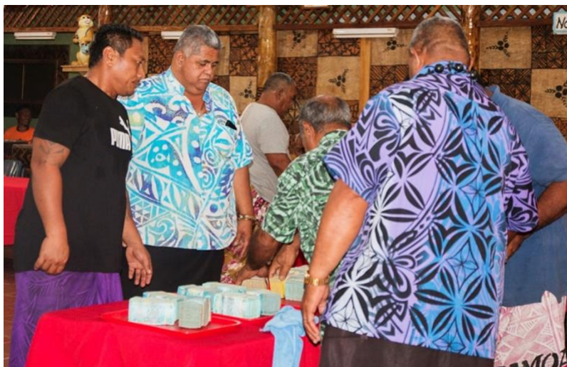
Residents from Gagaifomauga No.3. during the distribution of lease payments from the SEZ in past years

oceanfront to develop the Sasina Village Resort and a casino, 125 and to develop Asau airstrip and port. 126 Prime Minister Tuila'epa was keynote speaker at the signing ceremony. 127 An L.L.C. is a "limited liability company", used for tax advantages. The resort and casino were never built, and in 2020 the company was dis-established. 128