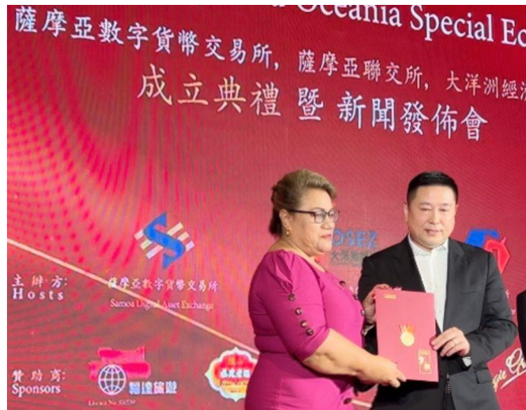
Mulipola with an unknown agreement at the launch of the SEZ, online .