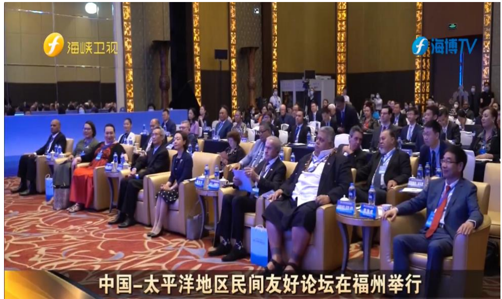
La'aulialemalietoa, who at the time was the Minister of Agriculture in the FAST 1 government attending the China-Pacific People's Friendship Forum in Fujian in May 2023.