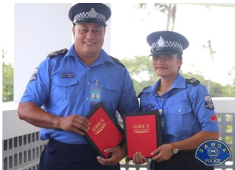
'Completion of Forensic Training and Handover of Equipment by Chinese Embassy', Apia, Sāmoa, Sāmoa Police, Prisons, and Corrections Service Facebook page, 5 December 2024, online .

On January 11, 2025, the PRC Embassy in Sāmoa held a 'Sāmoan Security Situation and Legal Lecture' for about 100 representatives of Chinese-funded institutions and overseas Chinese, 268 where Sāmoan police briefed attendees on local law and safety, so that they could “establish a good image for Chinese citizens”. 269