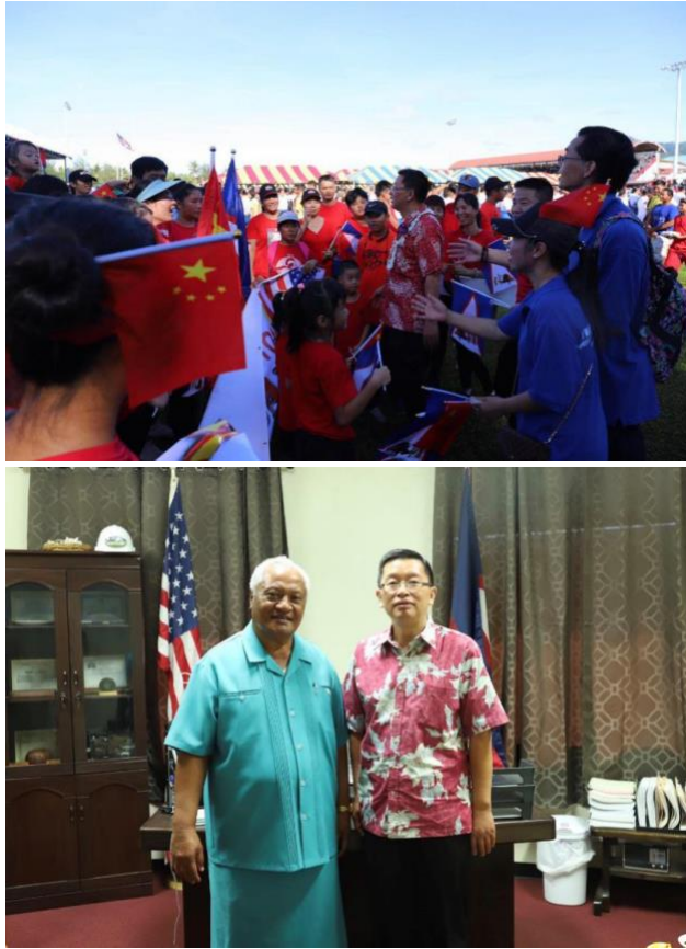
Photos from the 2019 visit of PRC Los Angeles Consulate Deputy Consul General visit to American Sāmoa to attend 'Flag Day', online .