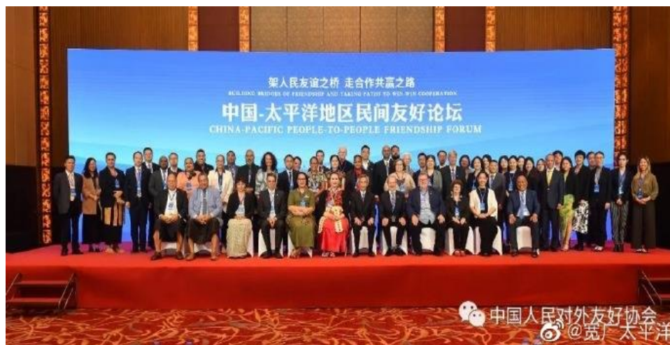
China-Pacific People's Friendship Forum conference photo. La'aulialemalietoa does not appear in this photo, online .

THE PRINCESS ROYAL, HER ROYAL HIGHNESS, PRINCESS SALOTE MAFILE'O PILOLEVU TUITA