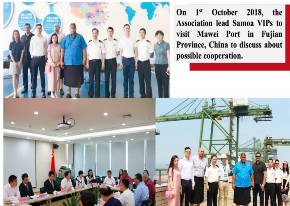
On 1 st October 2018, the Association lead Samoa VIPs to visit Mawei Port in Fujian Province, China to discuss about possible cooperation.